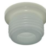
Adaptor – attaches to the Shower Hose