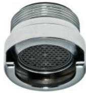
“Quick Fit Tap Aerator” in special casing (fits BOTH 24mm & 22mm male & female tap spouts (photo shows a male thread without the male/female adaptor)